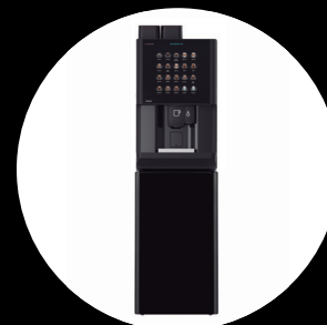
Single Base Cabinet VITROBC