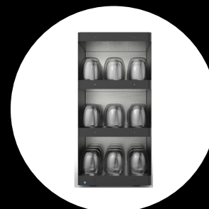
Cup Warmer VITROCWM