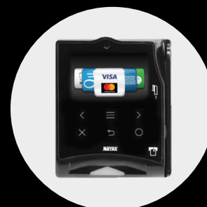
Nayax Contactless Payment System NAYAXCR-TB